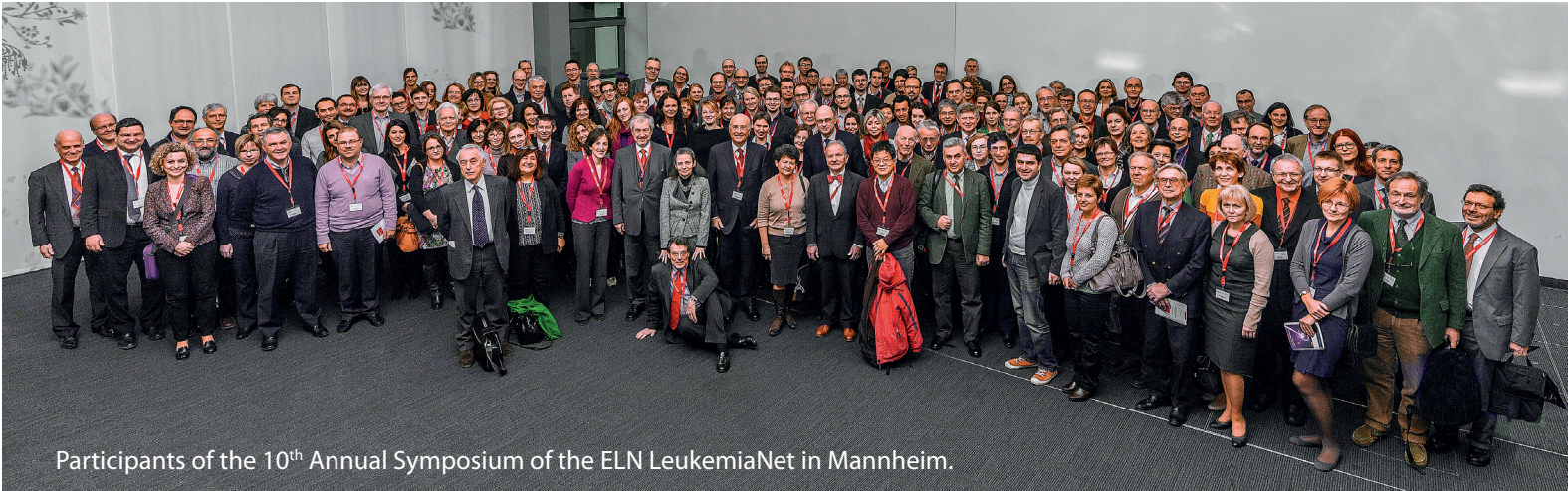
Participants of the 10 th Annual Symposium of the ELN LeukemiaNet in Mannheim.

Members of the ELN Foundation Circle pay an annual minimum contribution of 10.000 EUR. Small and medium size enterprises (SMEs) pay 5.000 EUR.